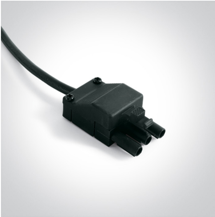
3-PIN Female connector